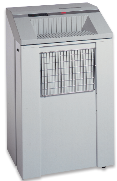
W/D/H 70 x 55 x 112 cm